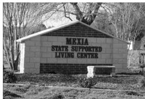
Mexia State Supported Living Center

Department of Aging and Disability Services (DADS) designated Forensic Facility (Texas Health & Safety Code Sec. 555.002)